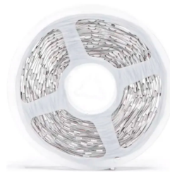
1x Led Strip