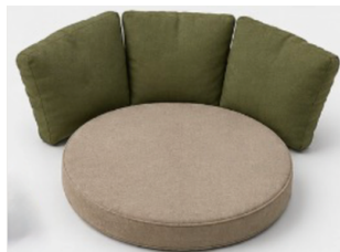
1x Cushions & soft components