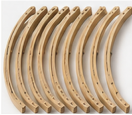
10x Structural wooden beams