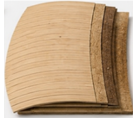
10x Wall panels