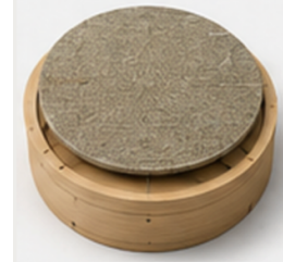
1x Floor Module