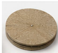
1x Top Module